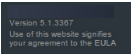
FIGURE 3. Current Cloudpath Version Lower Left